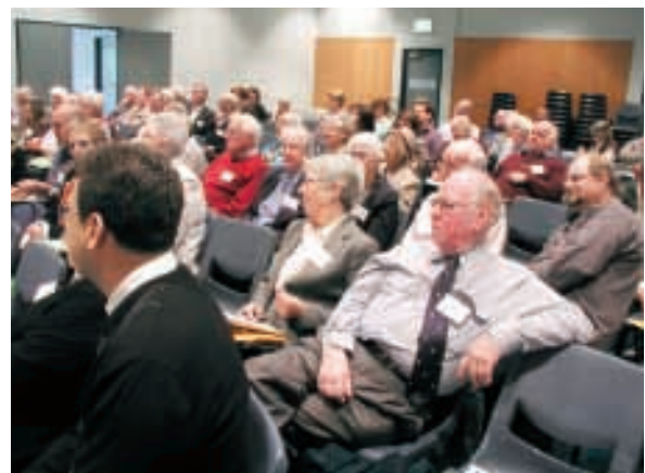
Opening session audience.

He also talked about the post-war immigration