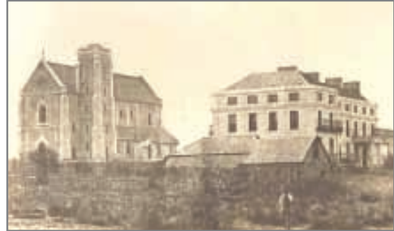
1865 Cathedral. The Bishop's Palace is in the foreground.