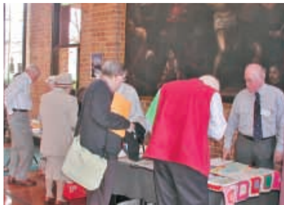
Right: Interest at the book table.